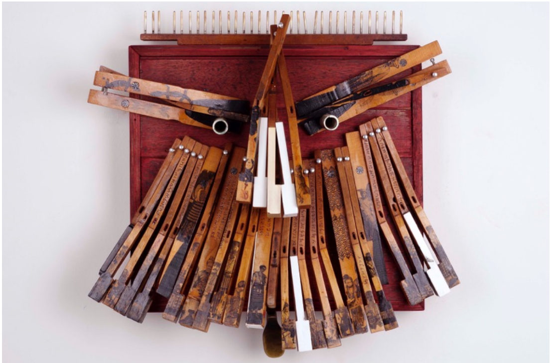
Pedal Face , 2014 Wooden parts of discarded piano and wood flooring, steel 65 x 6 x 25 cm