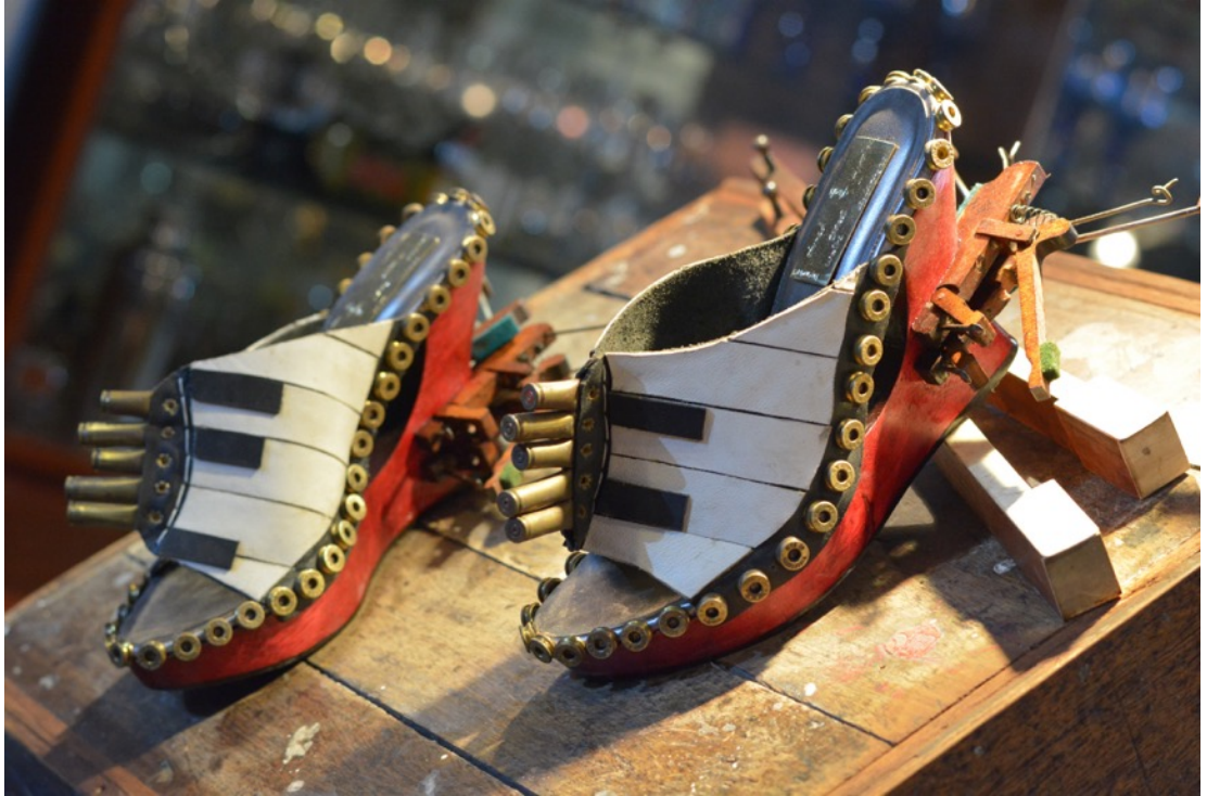
Shoo Thing , 2014 Wood, leather, steel, 92 pieces 9mm bullet shells, 45.5 x 51 x 23 cm